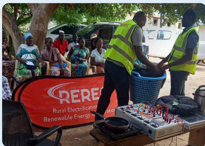
Energy Center Staff from Garissa conduct a public sensitization