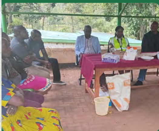
Customer Engagement week at Bukura Energy Center

Additional outreach activities were conducted in Homabay, Migori, Kisii, and Vihiga counties, where communities were engaged on clean cooking technologies, environmental conservation, and ongoing electrification initiatives. These forums also provided an opportunity for residents to raise concerns, seek clarification, and better understand REREC's mandate.