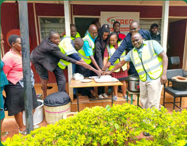
Kericho Energy Center