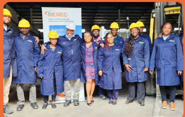
Mombasa Rd Stores and Regional Office