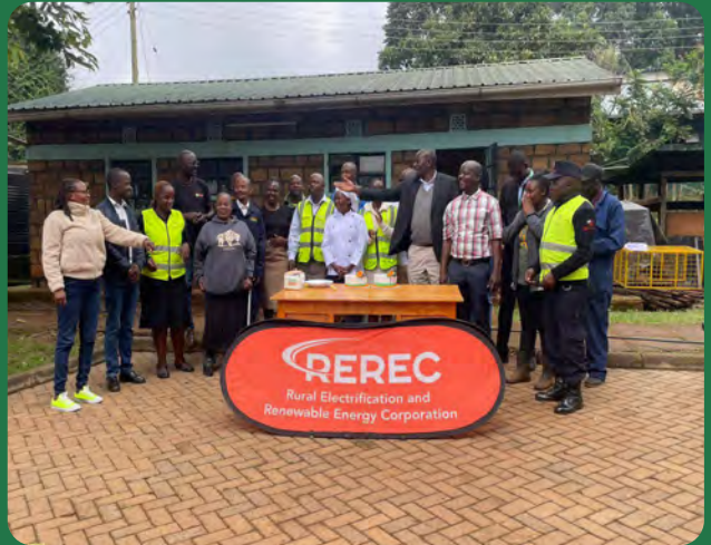
Kisii Regional Office