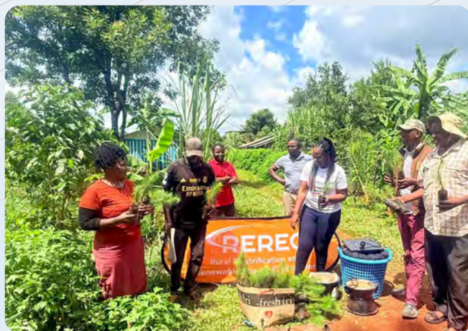
A team from Busia Energy Center distributing tree seedlings

Through these initiatives, REREC continues to promote sustainable energy solutions while supporting national climate action objectives.