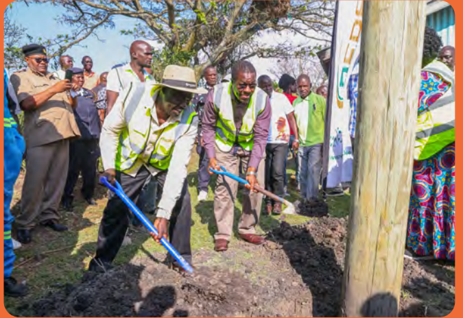
Hon. Opiyo Wandayi erects a pole at Wahambla

Among the projects commissioned during the period were the Keyo Nyang'wen Electrification Project in Homabay County and the Chebigoi Village Electrification Project in Chesumei Constituency, Nandi County, which will connect more than 100 households. In Homabay County, the Wahambla Rural Electrification Project also progressed through a ceremonial pole erection exercise led by Energy and Petroleum Cabinet Secretary Hon. Opiyo Wandayi.