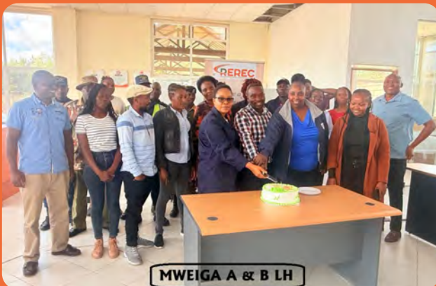
Mweiga Stores and Regional Office